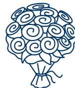
Floral Bouquet DEV52500

All fragrances codes above are oil soluble versions, but they are also available in water soluble form. For more information contact your HARKE representative.